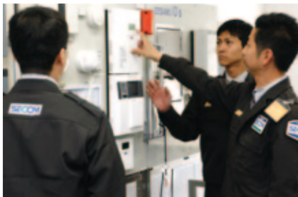
Training for employees to enhance know-how and skill levels

To ensure the quality of our services is consistently worthy of the SECOM name, we have established a framework in our security services business that ensures exceptional safety and reliability across all processes, from R&D through to maintenance, and conduct practical training for employees that aims to enhance their know-how and skill levels. We work to further enhance service quality by paying heed to feedback received by SECOM customer service centers, as well as by speaking directly to customers.