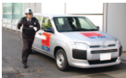
Fuel-efficient SECOM service vehicle

In the belief that protecting the environment is essential for our ability to provide security and support comfortable lifestyles, we continue to promote awareness of our environmental philosophy, which is to incorporate consideration for the environment into all areas of our operations, and our basic environmental policy among all employees. We are also implementing measures aimed at addressing such key issues as global warming and resource depletion and ensuring our operations conform with pertinent laws and regulations.