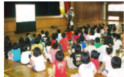
Safety class for children

These include offering programs for children, women and seniors designed to raise crime prevention awareness.