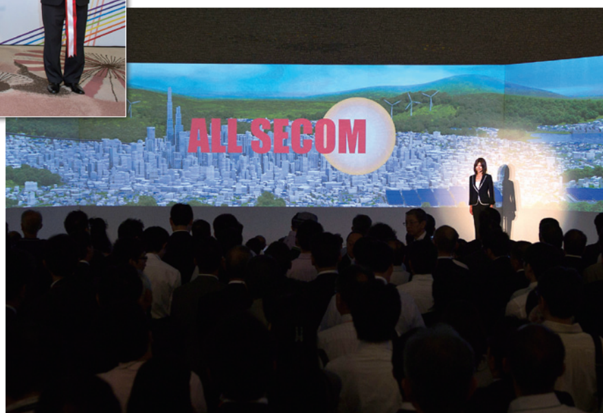
Presentation on SECOM's projections for security services in the near future