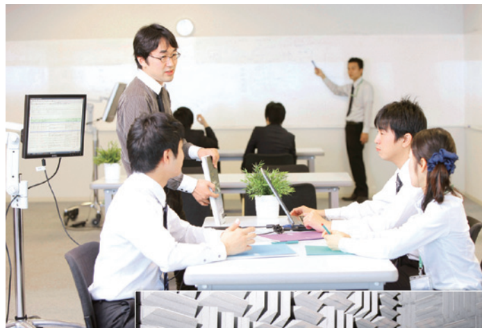
The Intelligent Systems Laboratory's broad focus ranges from physical security to medical care and social welfare services.

Since our establishment, we have sought to keep abreast of social trends, patterns of criminal activity and technological advances, thereby ensuring our ability to develop and market a broad range of systems that are needed and welcomed by society. One example of such a system is our on-line image