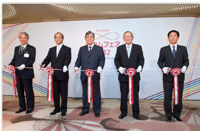
Ceremonial tape cutting marking the opening of the ALL SECOM-themed SECOM Fair 2012 in Tokyo

Going forward, we pledge to devote our utmost efforts to responding effectively to the expectations of customers, as well as to achieving further growth.