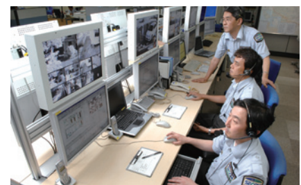
SECOM image monitoring center

Guided by the ALL SECOM concept, we will remain committed to providing comprehensive services that ensure our customers see us as a partner they can turn to at any time for solutions that will remove sources of unease and deliver security and peace of mind. In so doing, we will strive to reinforce our foundation for growth.