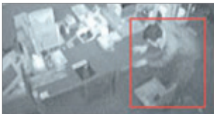
SECOM AX on-line image recognition system

Going forward, we will continue to draw on our outstanding technologies to develop and market systems that respond swiftly and effectively to customers' needs, as we press forward toward the realization of our Social System Industry vision.