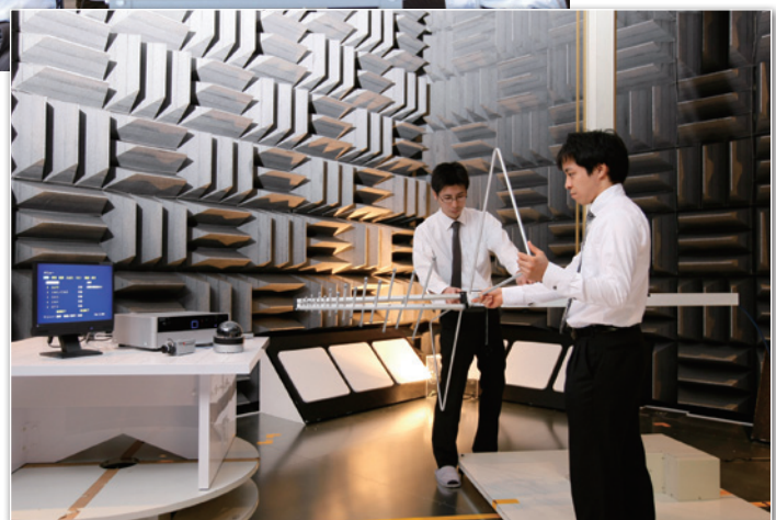
The Development Center conducts development in line with SECOM's own stringent standards.