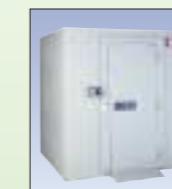
SECOM DATA SAFE

SECOM provides a range of services based on aerial mapping and GIS technologies, including PasCAL, a comprehensive service for local governments, and the Management-Navigation series of corporate management support services.