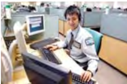
SECOM customer service center

To ensure the quality of our services is consistently worthy of the SECOM name we have established a framework in our security services business that ensures exceptional safety and reliability across all processes, from R&D through to maintenance, and conduct practical training for employees that aims to enhance know-how and skill levels, thereby contributing directly to improvements in quality and reliability. We work to further enhance the quality of our services by paying heed to feedback received by SECOM customer service centers, as well as by speaking directly to customers.