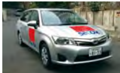
Fuel-efficient SECOM service vehicle

In the belief that protecting the environment is essential to our ability to provide security and support comfortable lifestyles, we continue to promote awareness of our environmental philosophy—which is to incorporate consideration for the environment into all areas of our operations—and our basic environmental policy among all employees. We are also implementing measures aimed at addressing such key issues as global warming and resource depletion and ensure our operations conform with pertinent laws and regulations.