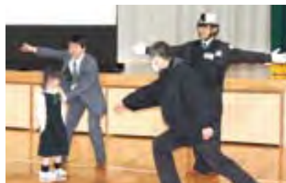
Crime prevention awareness program featuring skits and other activities

We recognize contributing to the community through the provision of