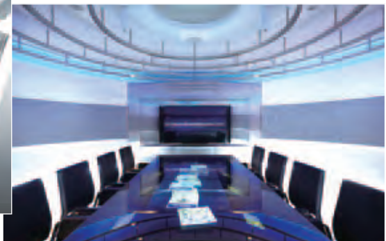
Conference room of the future