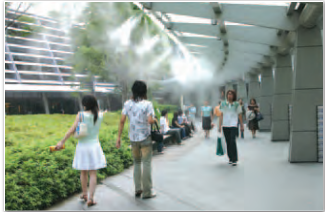
Dry Mist system

In the security services business, we offer a number of environment-friendly services. These include SECOM FX, an energy- and labor-saving security and facility control system designed for offices and shops. We also offer the SECOM Eco Data System, which calculates and displays electric power, gas and other energy consumed. By making energy use visible, the system assists the efforts of companies to reduce their energy consumption. Dry Mist, a Nohmi Bosai system that uses sprinkler technology to lower ambient temperature, helps reduce urban heat islands, one cause of global warming. Data from satellite images and aerial photography provided by Pasco is