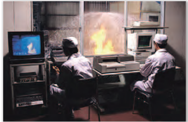
Test of low-expansion foam fire extinguishing system (Nohmi Bosai)

In the years ahead, we see significant potential in customizing our service model, developed specifically for Japan's super-aged society, to reflect the needs of other countries attempting to cope with the challenges of an aging population. Guided by the ALL SECOM concept, we will continue working to respond to evolving social imperatives by developing and providing services that make life more convenient and comfortable and deliver security and peace of mind. Through such efforts, we aim to be a company that truly makes a difference in society.