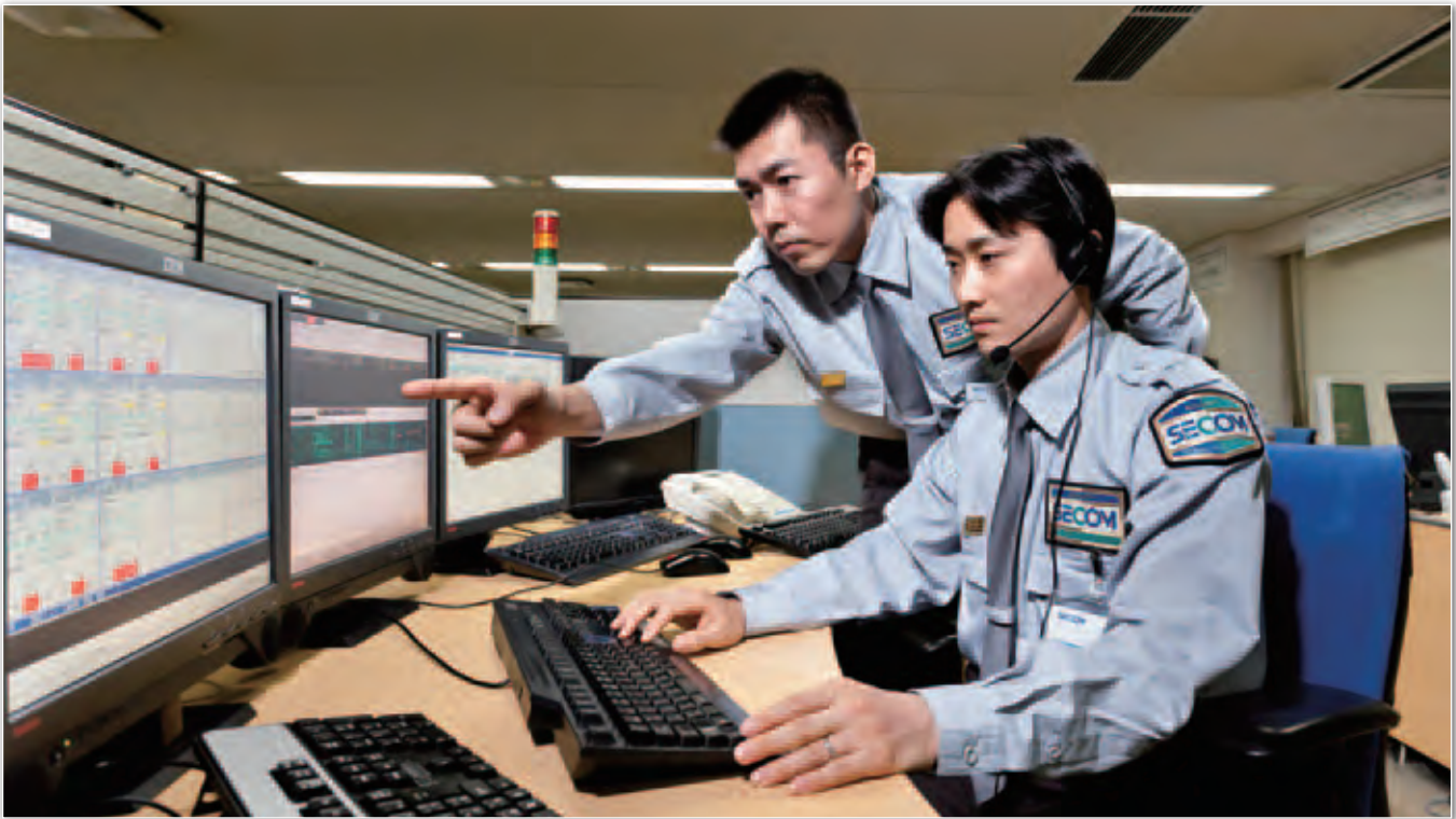
SECOM control center

analytical skills and prompt decision-making capabilities of people. To provide swift, quality emergency response services, we maximize the excellent judgment and accumulated know-how of SECOM control center staff and skills of our trained emergency response personnel, as well as our nationwide network of more than 2,800 emergency depots, which is the largest of any security services company in Japan. Employee education designed to foster the capabilities of SECOM security professionals is crucial to our ability to provide high-grade services, as is the effective management of human resources.